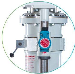
Hydraulic lift limit switch